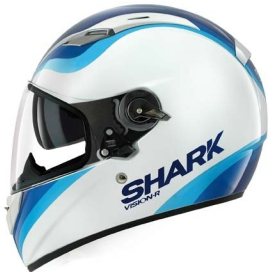
VISION - R PIXY ST White Blue