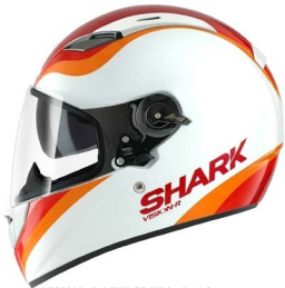
VISION - R PIXY ST White Red Orange