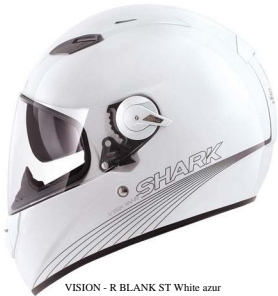
VISION - R BLANK ST White azur