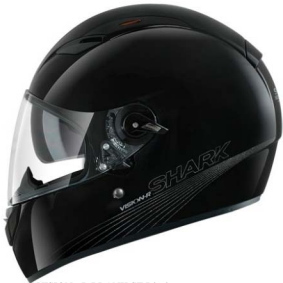
VISION - R BLANK ST Black