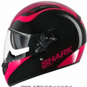
VISION - R PIXY ST Black Violet Pearl