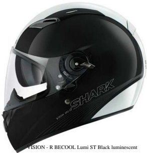
VISION - R BECOOL Lumi ST Black luminescent