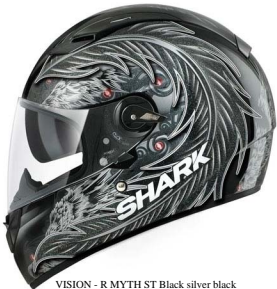
VISION - R MYTH ST Black silver black