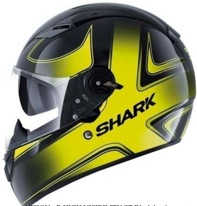
VISION - R HIGH VISIBILITY ST Black luminescent