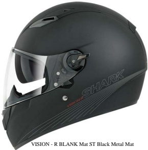
VISION - R BLANK Mat ST Black Metal Mat