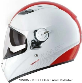
VISION - R BECOOL ST White Red Silver