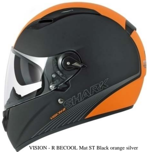
VISION - R BECOOL Mat ST Black orange silver