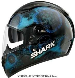
VISION - R LOTUS ST Black blue