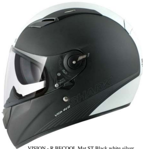
VISION - R BECOOL Mat ST Black white silver