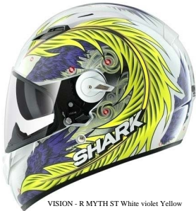
VISION - R MYTH ST White violet Yellow